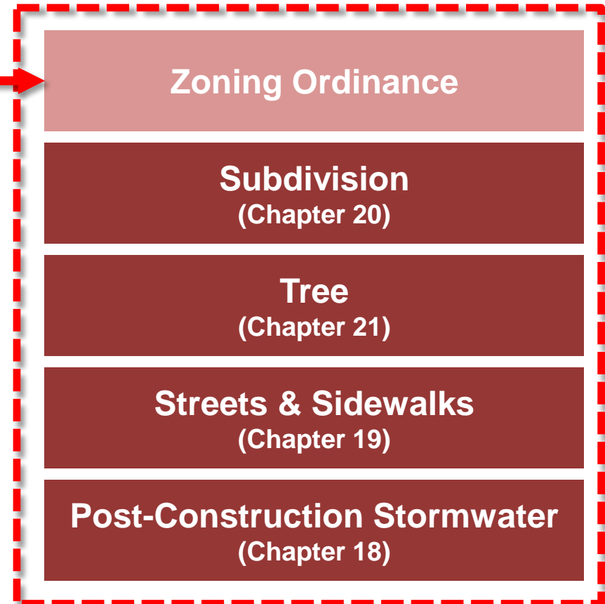
Unified Development Ordinance