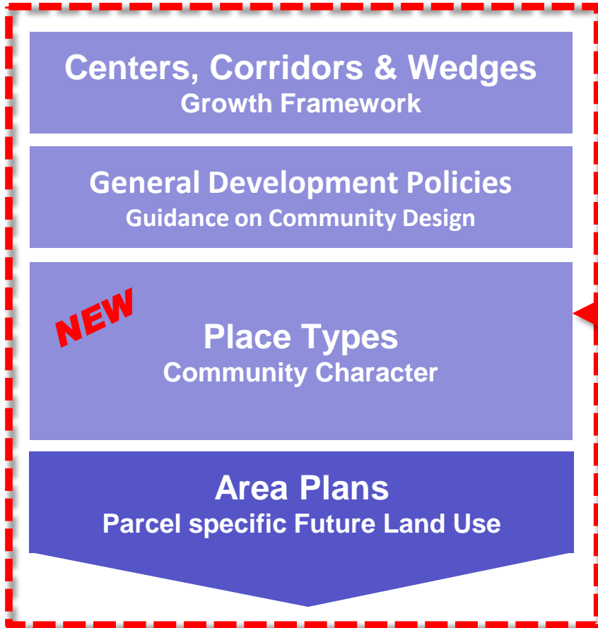
Unified Vision for Charlotte